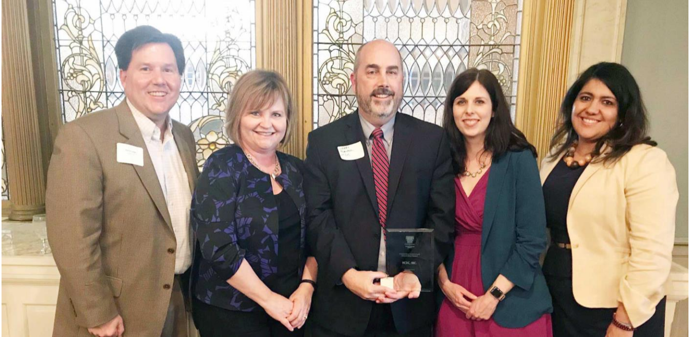
HCDC Inc. wins the ASPA Greater Cincinnati 2019 Cincinnati Government Cooperation Award